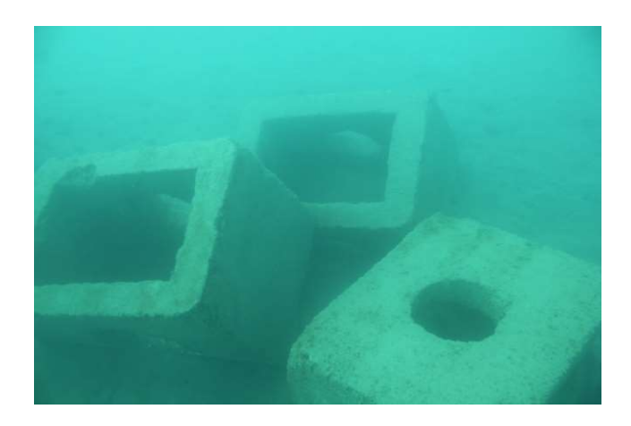
Figure 4. Underwater view of artificial reefs

With the help of a truck crane, reefs connected with cloth slings were transferred to the service ship, transported to the area and deployed on the seafloor (Figure 4).