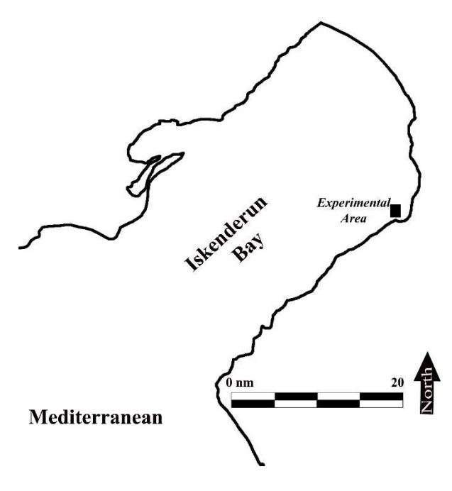
Figure 1. Study area

Experiments were carried out in the Iskenderun Bay on November 2013 and continued until October 2014 at 36^{\circ} 35 43.5 " N, 36^{\circ} 10' 30.3 " E. (Figure 1). As the soil structure is sand, a region with a light rocky area was found and reefs were placed at a depth of 7.5 meters and the location of the area where the study was made without any obstacle for marine traffic.