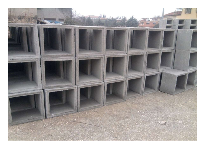
Figure 2. Cubic concrete materials

The study was carried out by building 172 concrete materials (150 cubic and 22 octagonal) in September 2013. Our concrete blocks were prepared in two different types. The first group of concrete reefs were 50cm x 50cm x 50cm in size and the concrete thickness is 150 pieces manufactured in 5cm thickness. (Figure 2).