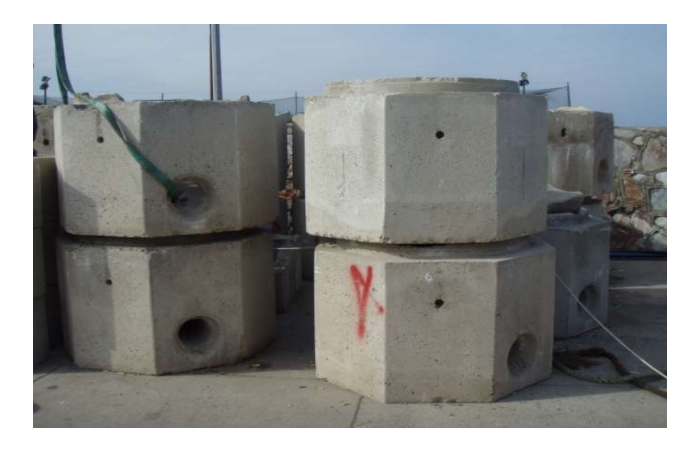
Figure 3. Octagonal concrete materials

The second group of concrete reefs were octagonal in shape and each side is 60 cm, height is 40 cm, concrete thickness is 12 cm and circular parts are 10 cm radius in the edge parts (Figure 3).