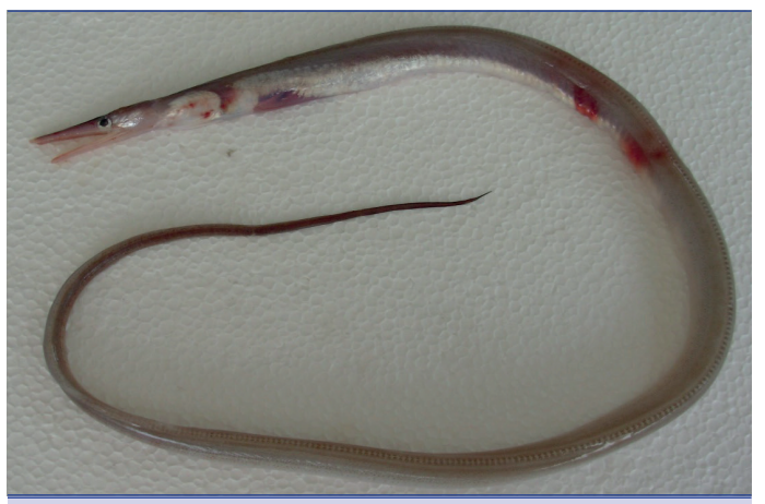
Figure 2. Nettastoma melanura Rafinesque, 1810 in the North-eastern Mediterranean.

Lengths (TL) and weights (g) of a total of 102 fish specimens belonging to 3 fish species from 3 families were measured, recorded and analyzed (Figure 2, Figure 3, and Figure 4). The sample size, minimum maximum length as well as the LWRs, the coefficient of determination (r²), the standard error and confidence interval (CI) of b for each species are presented in Table 1.