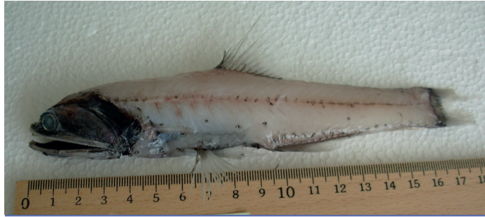
Figure 3. Lampanyctus crocodilus (Risso, 1810) in the Northeastern Mediterranean.