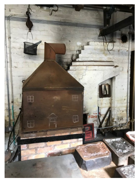
Figure 11 The original production system and metal moulds (Photograph taken by the author).

The J&W Evans Silver Factory is one of the most influential places to interpret the unique traditional atmosphere of the silver production factory and learn about the industrial heritage of the Jewellery District (Figure 12).