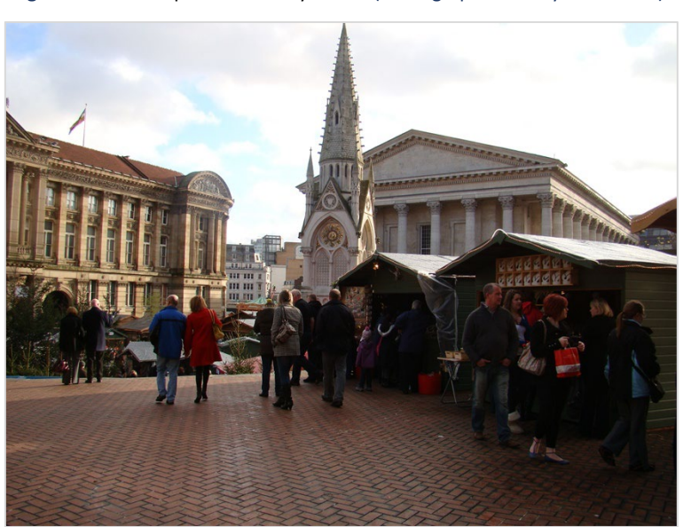
Figure 6 Squares are actively used for local events (Photograph taken by the author).

The scientific, artistic, archaeological, cultural, and social values of the city are interpreted in thematically designed museums such as jewellery museum, pen museum, coffin museum, etc. It is designed as a static and/or dynamic-interactive museum in accordance with the museum's themes. It is observed that traditional and/or innovative interpretation-experience tools related to the themes of museums are designed in addition to the principles of digital interpretation equipped with the opportunities of the age in interactive museums. The cemeteries in the city are protected together with their landscape as urban spaces where the urban memory can be perceived as an open-air museum.