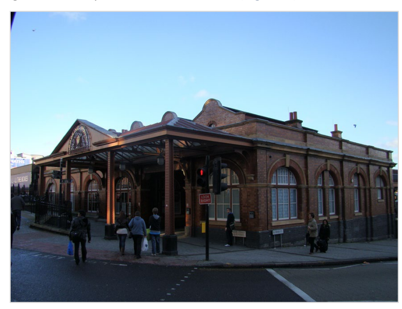
Figure 4 Railway stations allow to interpret railway heritage in Birmingham (Photograph taken by the author).

The railway network and architectural heritage, which started to be used actively in Birmingham right after the canals, is another interpretation element in the urban structure. Preserving and using the railway stations today and presenting the histories of the buildings in the station buildings allow the railway heritage to be interpreted and understood (Figure 4).