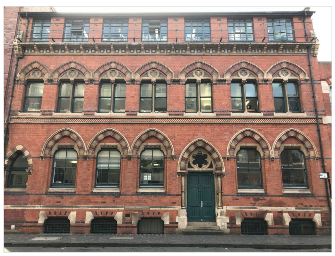
Figure 7 Birmingham City University, School of Jewellery in the Jewellery Quarter.

In order to provide education in the art of jewellery, which developed based on the master-apprentice system, the first Jewellery School of Birmingham was established in a metal factory located on Vittoria Street in 1890 in the Jewellery Quarter. Today, the education continues in the same building under the Birmingham City University, School of Jewellery. Sustainability of jewellery art is ensured by the inclusion of jewellery workshops, which form the character of the area, within the school, where the education of jewellery production is provided by both traditional and contemporary methods. The library in the school contains all local resources related to the Jewellery Quarter. The school's location in the Jewellery quarter contributes to the continuation of the functional identity of the area (Figure 7-8).