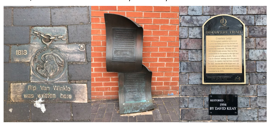
Figure 14 Some examples of interpretation items in the Jewellery Quarter.

Interpretation items in the Jewellery Quarter are located at every point of the area. There are statements and signboards describing important moments and memories on pavements, roadsides, open areas, building facades, and so forth (Figure 14). From the moment you enter the protected area, information about the area is systematically transferred to the visitors.