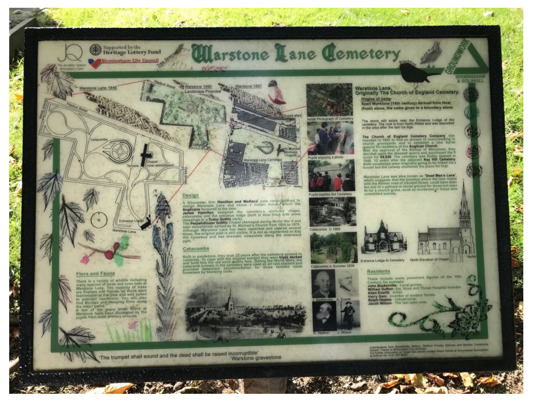
Figure 13 The historical cemetery area in the Jewellery Quarter turns into a public activity area especially on important days. For example, the Halloween event takes place in the cemeteries. The historical values of the cemetery area are shared with the participants and the interpretation of the area is carried out.

Interpretation items in the Jewellery Quarter are located at every point of the area. There are statements and signboards describing important moments and memories on pavements, roadsides, open areas, building facades, and so forth (Figure 14). From the moment you enter the protected area, information about the area is systematically transferred to the visitors.