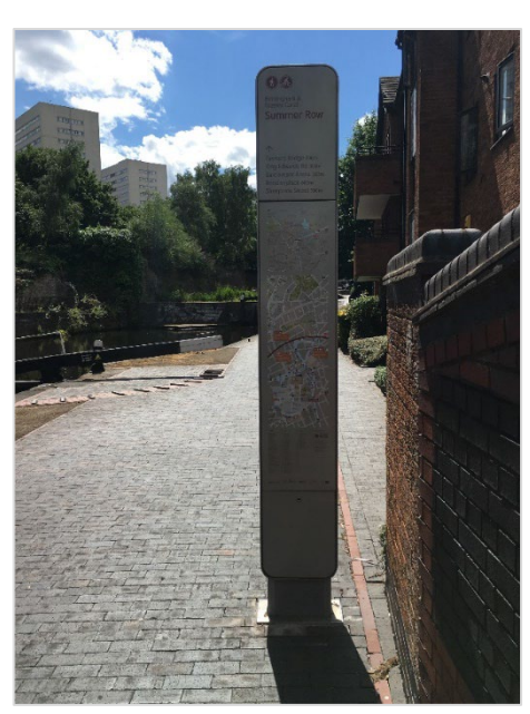
Figure 2 Interpretation signs around the canals.