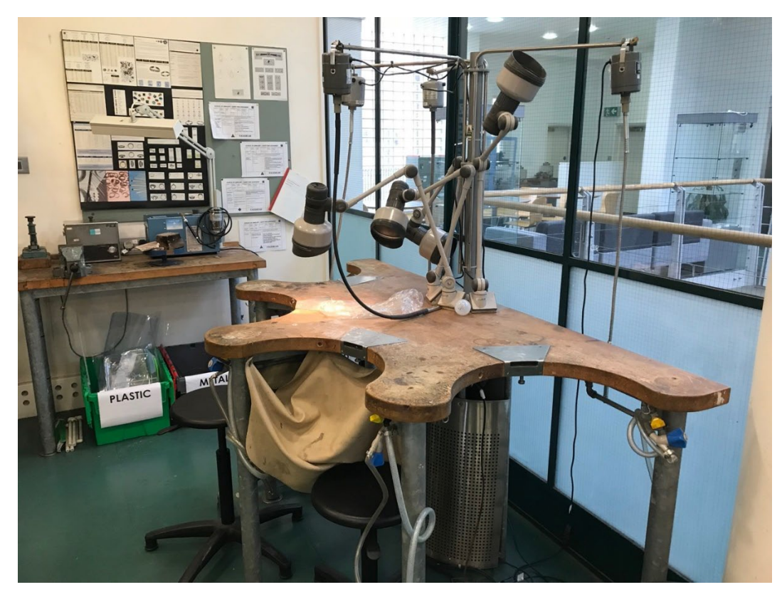
Figure 8 School of Jewellery classrooms (Photograph taken by the author).

The interpretation of the area is provided through the museums in the Jewellery Quarter. Through the thematic museums in the area, the different and various historical values of the heritage site are interpreted. The different themes of the museums allow visitors to understand and interpret the different values of the area. Some of the thematic museums are Pen Museum, Coffin Museum, J&W Evans Silver Factory Museum and Museum of the Jewellery Quarter. In the Pen Museum, there are activities and presentations about the contribution of the Birmingham Jewellery Quarter to the production of pen in England and the interpretation of the pen as one of the cultural heritage values of Jewellery Quarter. The Coffin Museum also known as Newman Brothers Coffin Works another very well conserved and designed museum in order to interpret the original coffin works in the original factory building (Figure 9).