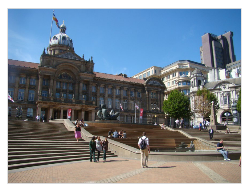
Figure 5 Victoria square in the city centre (Photograph taken by the author).