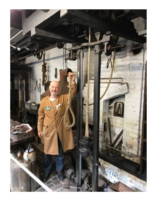
Figure 10 The metal works of coffins are interpreted by the interpreters (Photograph taken by the author).

All production system and items of the factory are conserved and experienced while visiting the museum. The traditional production system of the factory is interpreted by the interpreters. The museum has ordinary public events and programs including school tours by setting up interpretation experience to get information about one of the unique and not very well-known cultural heritage value of the Jewellery Quarter. (Figure 10-11).