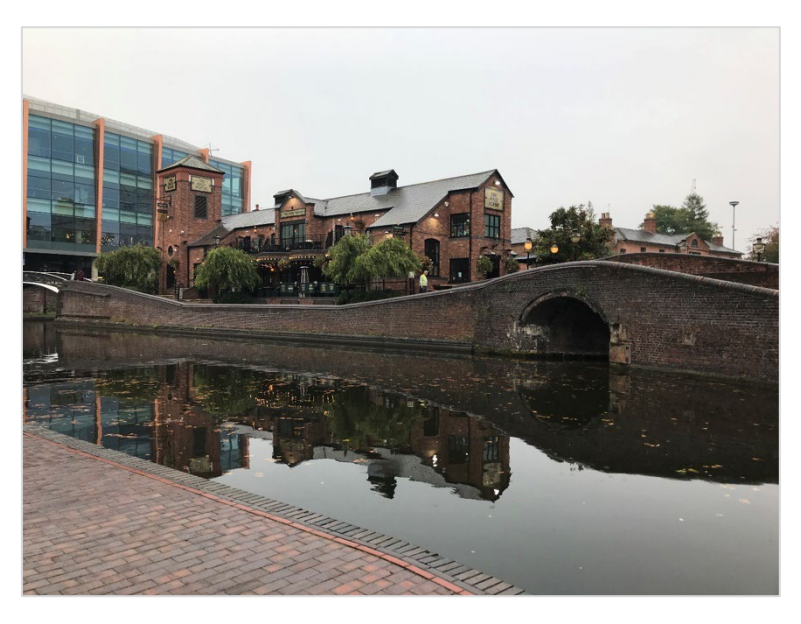
Figure 3 Birmingham canals and near surrounding.

The railway network and architectural heritage, which started to be used actively in Birmingham right after the canals, is another interpretation element in the urban structure. Preserving and using the railway stations today and presenting the histories of the buildings in the station buildings allow the railway heritage to be interpreted and understood (Figure 4).