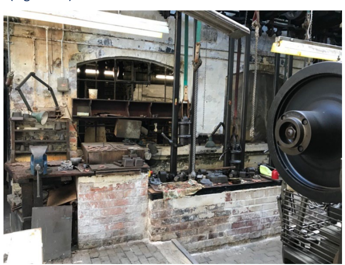
Figure 12 The inside of J&W Evans Silver Factory (Photograph taken by the author).

The J&W Evans Silver Factory is one of the most influential places to interpret the unique traditional atmosphere of the silver production factory and learn about the industrial heritage of the Jewellery District (Figure 12).