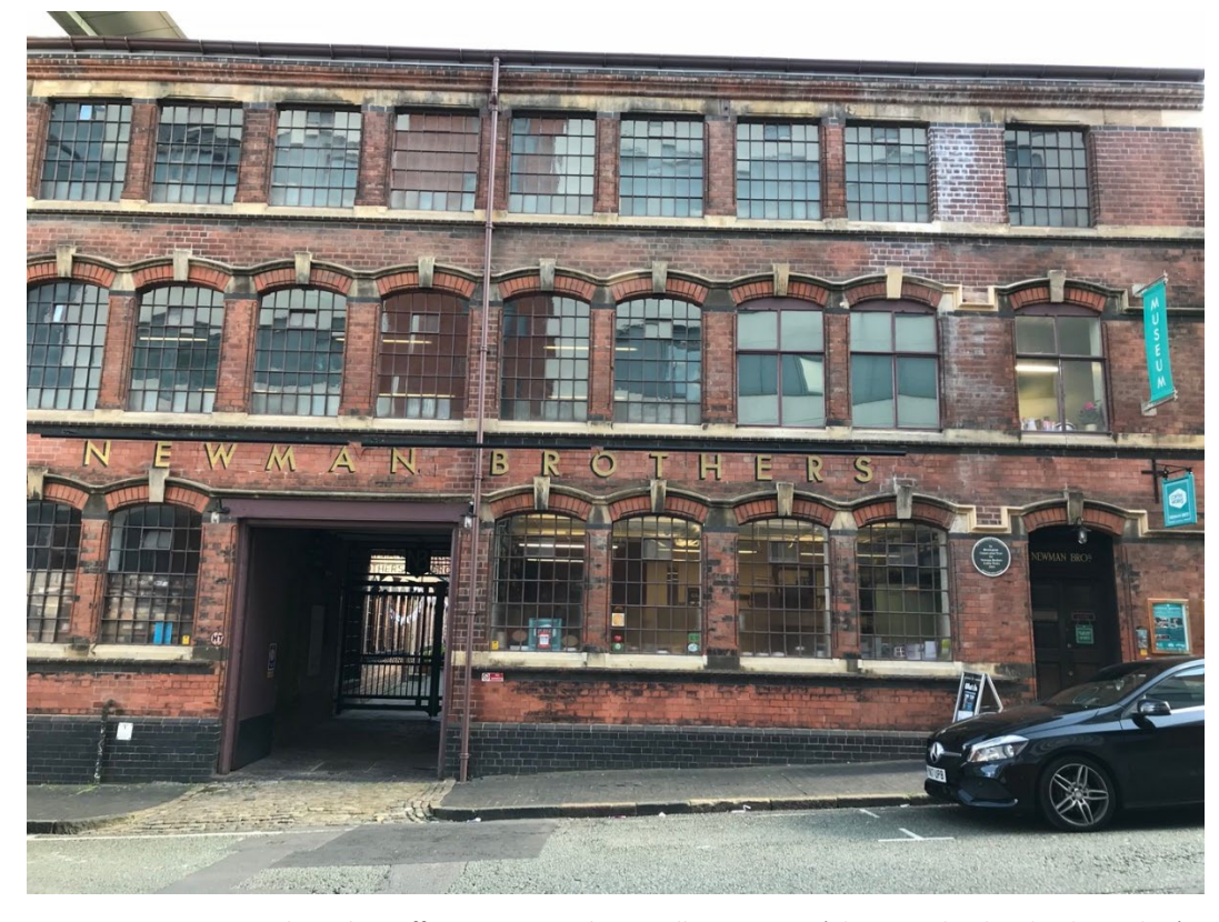
Figure 9 Newman Brothers the Coffin Museum in the Jewellery Quarter (Photograph taken by the author).

All production system and items of the factory are conserved and experienced while visiting the museum. The traditional production system of the factory is interpreted by the interpreters. The museum has ordinary public events and programs including school tours by setting up interpretation experience to get information about one of the unique and not very well-known cultural heritage value of the Jewellery Quarter. (Figure 10-11).