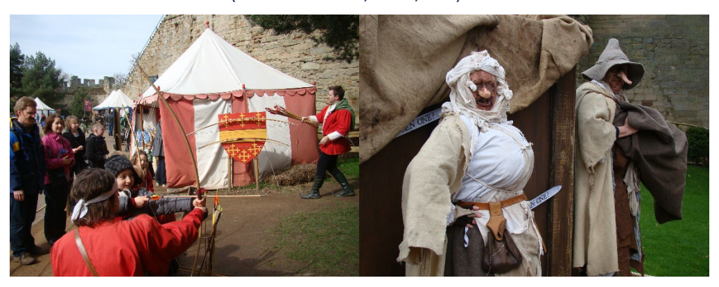
Figure 1 The living history interpretation activities at Warwick Castle (Photographs taken by the author).

Fundamentally, the subjective approach in interpreting the heritage sites can mainly be seen where the economic benefit of interpretation exists. Within the last four decades, especially in the UK, heritage interpretation has been used to get economic benefits from the visitors by organizing living history presentations, which are called as "live interpretation". It has become popular and commonplace in many Western countries (Evans, 1991). Within the scope of this approach, heritage interpretation focuses on setting an amusement activity place by using any kind of historical reference. Initially it is defined as "being any presentation using people, usually costumed, whether in an historical environment or not, which aims to place artefacts, places or events in context against the background of the human environment of the past" (Robertshaw, 2006, 42). This approach creates manufactured heritage interpretation, in which heritage sites become stages for historical amusements and create economic benefit to the investors. It is mainly focus on tourist attractions by various living history activities on the heritage sites and create illusions for having tourists' motivations (Figure 1). This form of interpretation has been criticized not only for blurring the lines between education and entertainment but also perceived as inherently 'fake' simply because of its theatrical overtones (Malcom-Davies, 2004, 281).