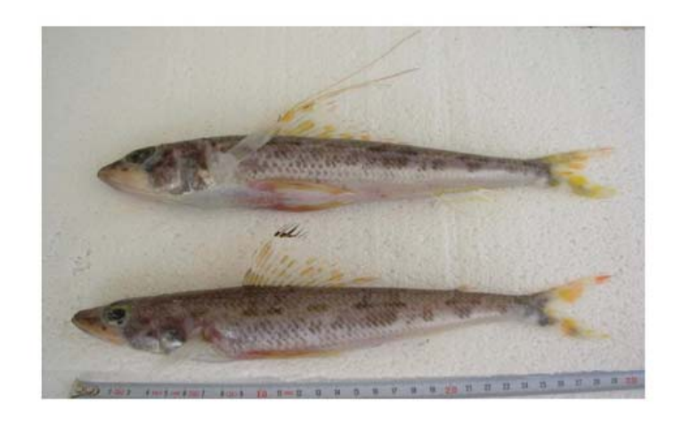
Fig 2. Male (above) and female (below) specimens of Aulopus filamentosus , 290 mm total length, (MSM-PIS/2015-4) and 285 mm total length, (MSM-PIS/2015-5) from Mersin Bay, northeastern Mediterranean Sea, Turkey

the males are more brightly colored, with red, orange and yellow markings, and bars on fins, but females might also present smaller reddish to orange marks on fins; color in the scales are iridescent with transverse bands, and the belly silvery to whitish or light pink; adipose fin tip yellowishgreen to orange.