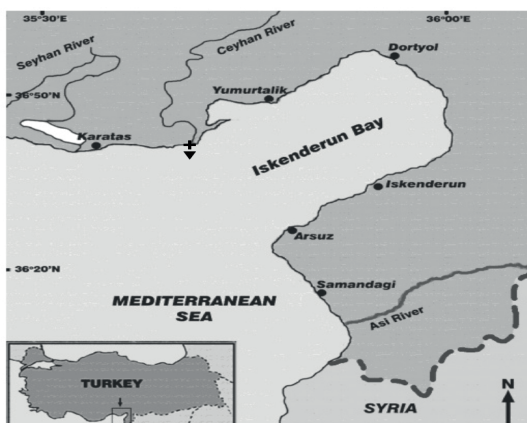
Figure 1. Map showing the sampling location (1: plus, +; 2: inverted triangle, ▼)

According to previous references, approximately 32 mysid species (Turkish Black Sea: 5, the Turkish Strait System: 14, Turkish Aegean Sea: 26, Turkish Mediterranean Sea: 3) are known from the Turkish coast and among these 3 species occurred on the Levantine Sea coast Turkey (Bakır et al. 2014). With this new record, the number of mysid species known from the Levantine Sea coast of Turkey increased to 4. Consequently, this study focuses on the first presence of M. slabberi from the Levantine coast of Turkey.